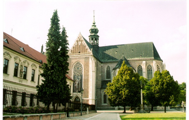
Mendel's Abbey, 2005