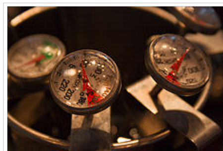
Bi-metallic stem thermometers used to measure the temperature of steamed milk