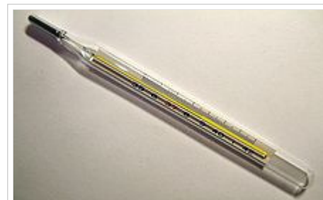
A clinical mercury-in-glass thermometer

There are many types of thermometer and many uses for thermometers, as detailed below in sections of this article.