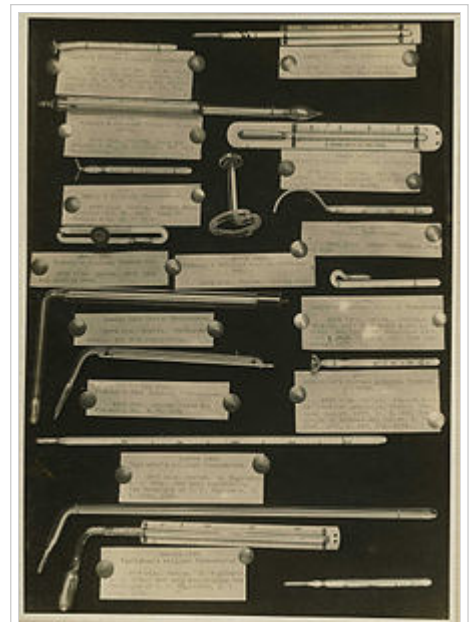
Various thermometers from the 19th century.