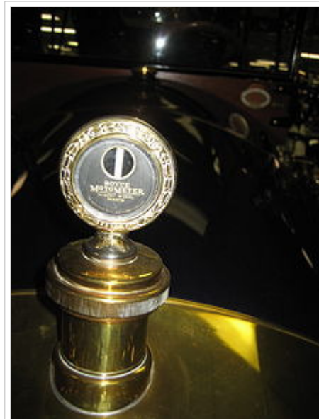
The "Boyce MotoMeter" radiator cap on a 1913 Car-Nation automobile, used to measure temperature of vapor in 1910s and 1920s cars.